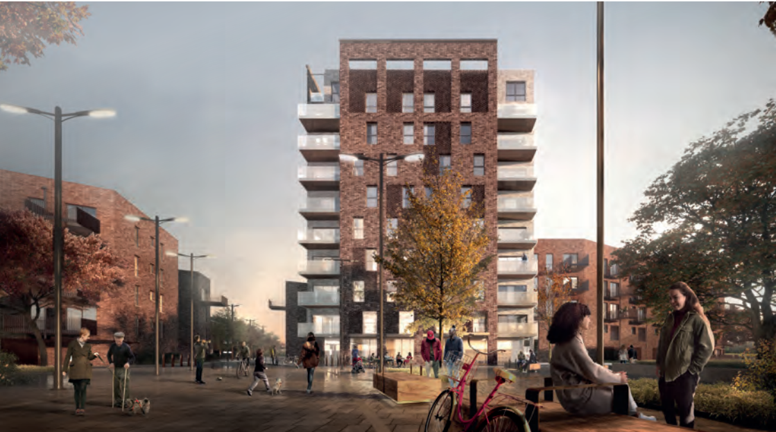
Artist's impression of the sparks

Over the last few months we have been updating the phase one designs of homes and outside spaces. In October we consulted with residents on the latest designs.