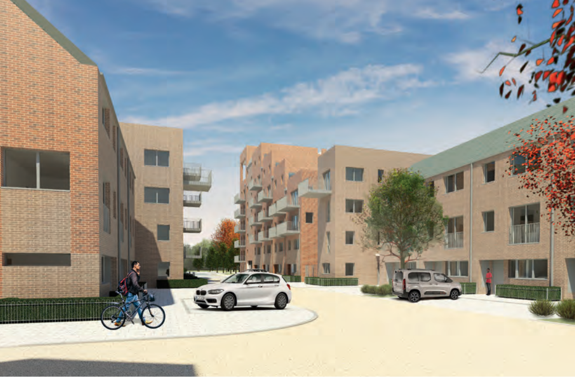
Artist's impression of the homes in the first phase